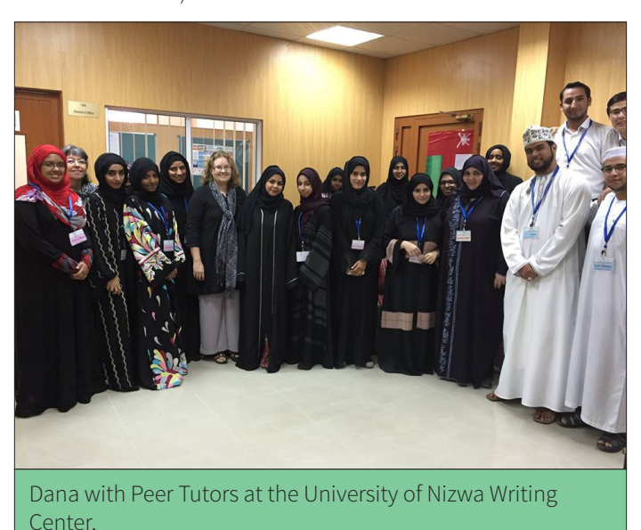
What I discovered at the conference, and in my visits to various writing centers in Oman, is that writing centers—while practically unknown in the region a decade ago—are

Last April, I had the delightful opportunity to visit writing centers throughout Oman and give a keynote address at the Middle East North Africa Writing Center Alliance (MEN-AWCA) conference. The MENAWCA conference was a joint conference being held in conjunction with the International English Language Teaching Conference in Muscat, Oman. Given this dual audience, my keynote address introduced the audience to learning transfer and explored the role and potential collaborations of English language teachers and writing centers in facilitating long-term writing development and learning transfer. I shared data from my longitudinal study through the presentation of the writing experiences of two students and demonstrated how these students' struggles and successes offer us a variety of strategies for tutoring and teaching with transfer in mind. An article based on my presentation* was recently published in TESOL Arabia Perspectives (Volume 24, No. 3, November 2016).