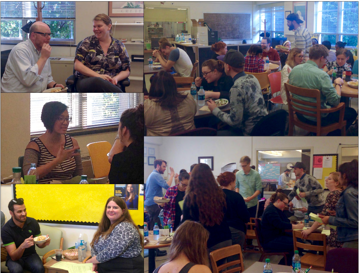
This semester we held a meeting that included the entire Writing Lab staff for the first time. We provided food and everyone participated in a fun activity sharing their Writing Lab experiences.