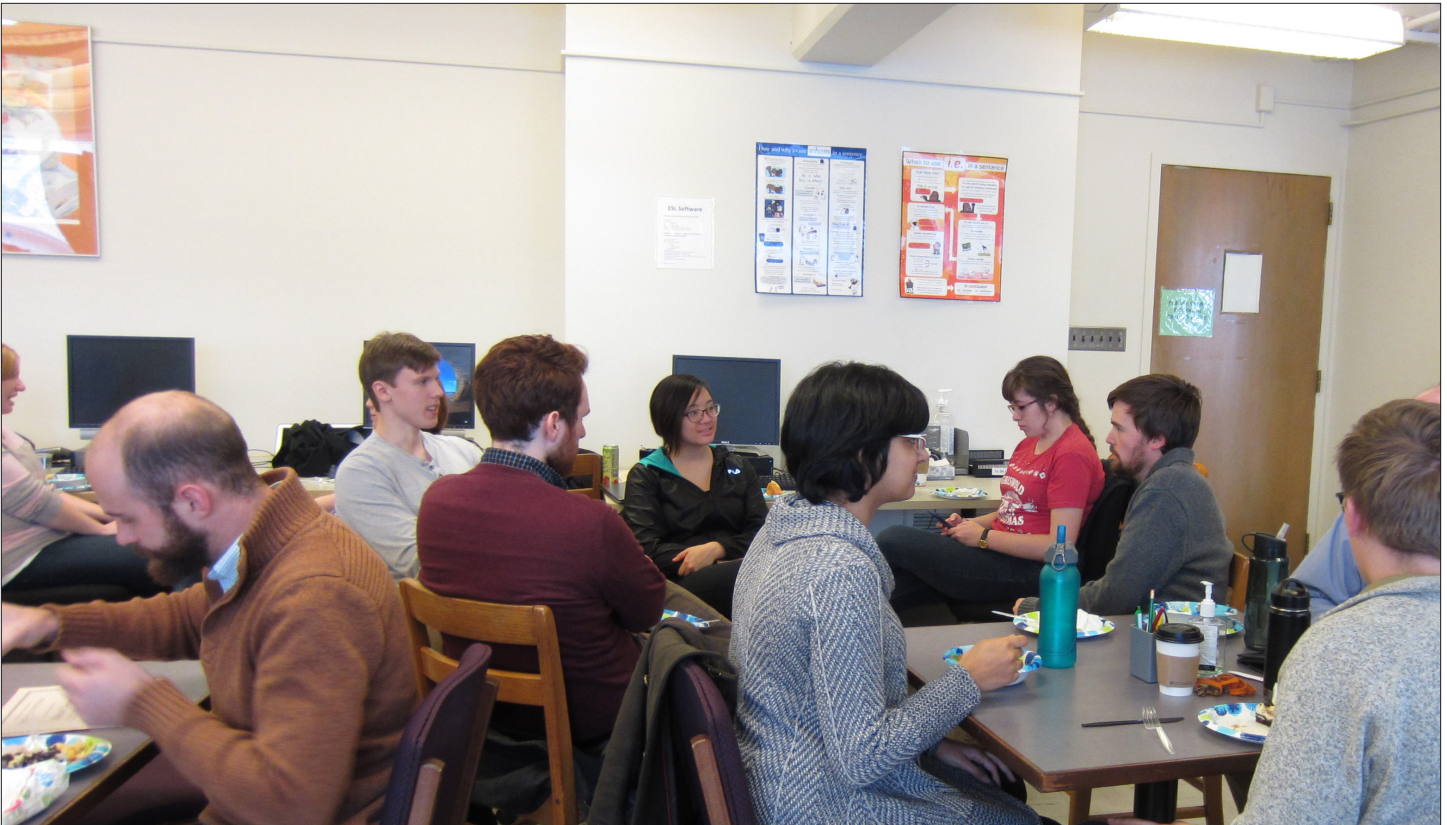
Tutors share a meal at our Fall 2016 end-of-semester potluck.